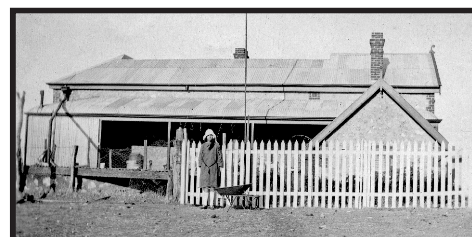
MURRAY COOK'S HOMESTEAD, EVERARD (1927)