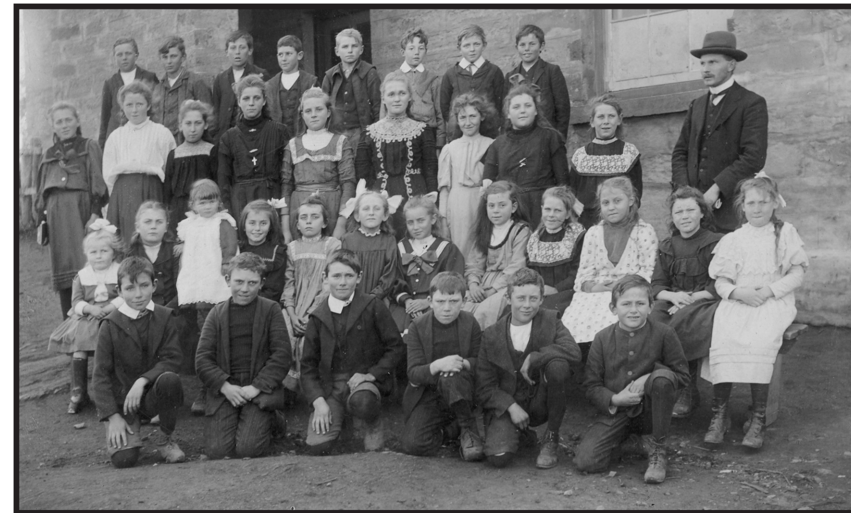
EVERARD EAST SCHOOL STUDENTS & MALE TEACHER (date unknown)