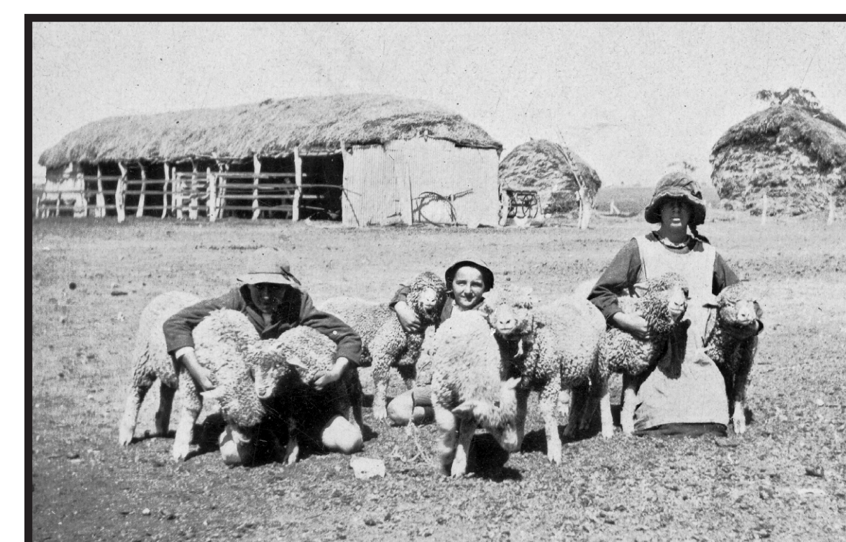
PET LAMBS ON COOK'S FARM, EVERARD (1926)